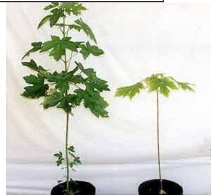
Figure 3: Maple tree on left treated with mycorrhizal