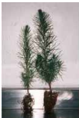
Figure 1: Tree on right treated with mycorrhizal

These tiny filaments (mycorrhizal fungi) actually attach and penetrate between and within the outer cells of the root cortex of plants and effectively become extensions of the root system itself. This is of a pine tree root.